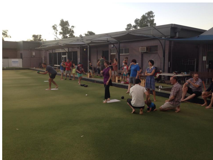
A private birthday party at the bowling club